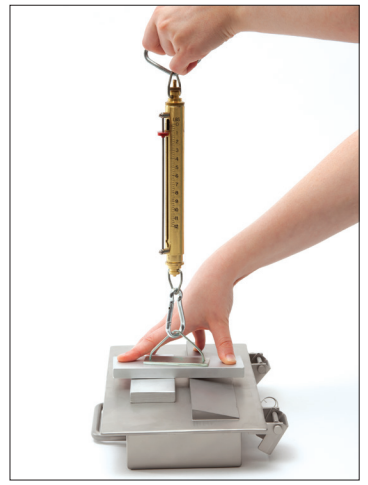
Standard Mechanical Scale

Rare Earth Plate Magnet Pull Testing Photos